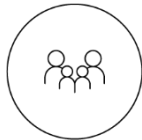
Great for families