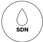
Solution dyed nylon