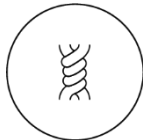
Tight twist set