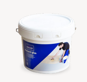
Parquet glue QSWGL16 Glue 16kg - For direct stick coverage1m<sup>2</sup>/1kg

To enjoy a full warranty, use only Uniclic installation kit, recommended underlay and cleaning product.