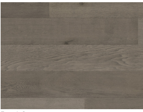
French Grey WB08008