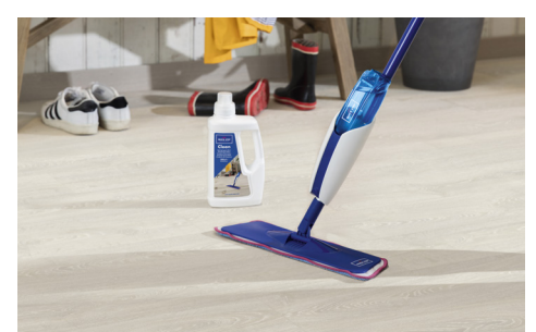
Cleaning kit QSSPRAYKIT A simple way of keeping your floor looking new

Quiet-Step Underlay QSC-LAY20FS or QSC-LAY50FS This underlay provides a reduction of foot fall noise of up to 30% over standard underlays. Available in 20 and 50m<sup>2</sup> rolls x 2mm