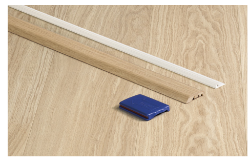
Incizo profile QSWINCP(-) Multi functional finishing accessory 215 x 4.8 x 1.3cm

Nature's Oak offers a complete solution with closely matching accessories for a beautiful finish of your floor.