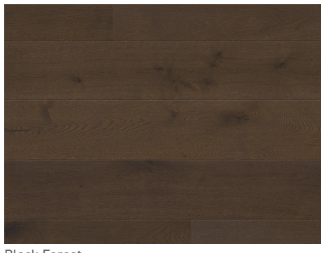
Black Forest WB09008