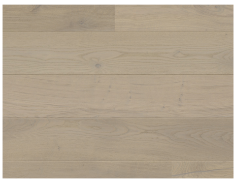
Aspen Grey WB03008