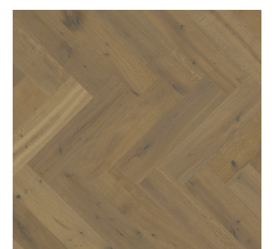
Denali Herringbone WB05132