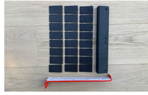
Installation set RFIK Allows easy and professional installation