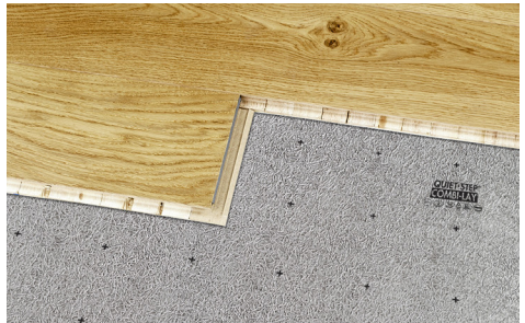
Underlay C-LAY20FS or C-LAY50FS Combilay provides a good reduction of reflected and impact noise and is available in 20 and 50m<sup>2</sup> rolls x 2mm

To enjoy a full warranty, use only Uniclic installation kit, recommended underlay and cleaning product.