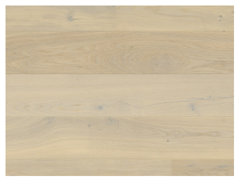
Arctic White WB00008