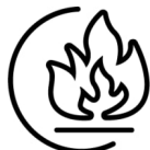
Fire Rated Carpet