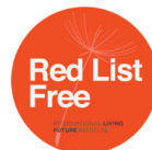
Declare® Red List Free