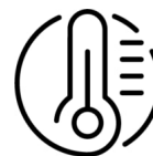
Thermal Insulation and Humidity Control Contract Medium Duty - 2 Star