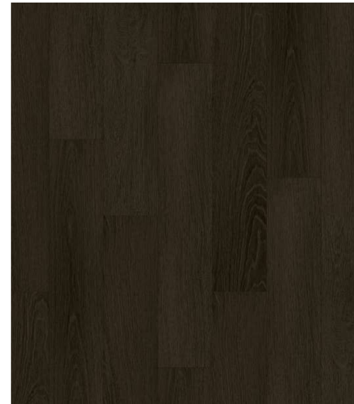
Cocoa Oak | 190