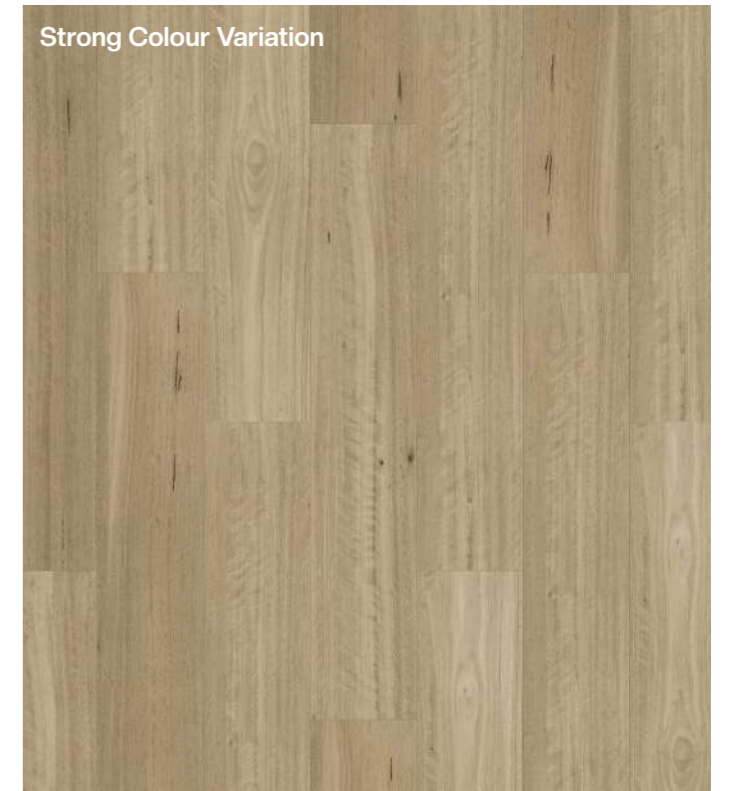
Somerset Blackbutt | 215