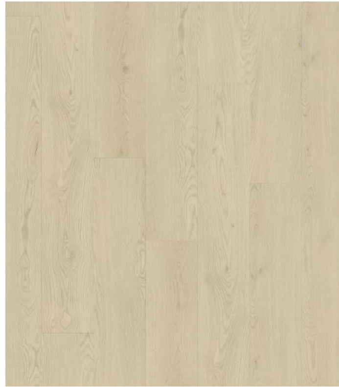
Chardonnay Oak | 105