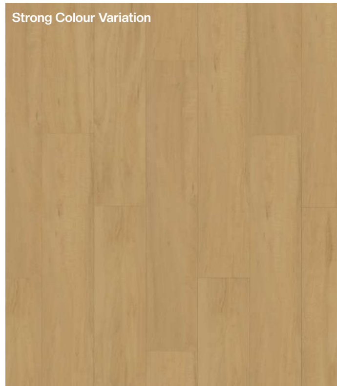
Franklin Tassie Oak | 415