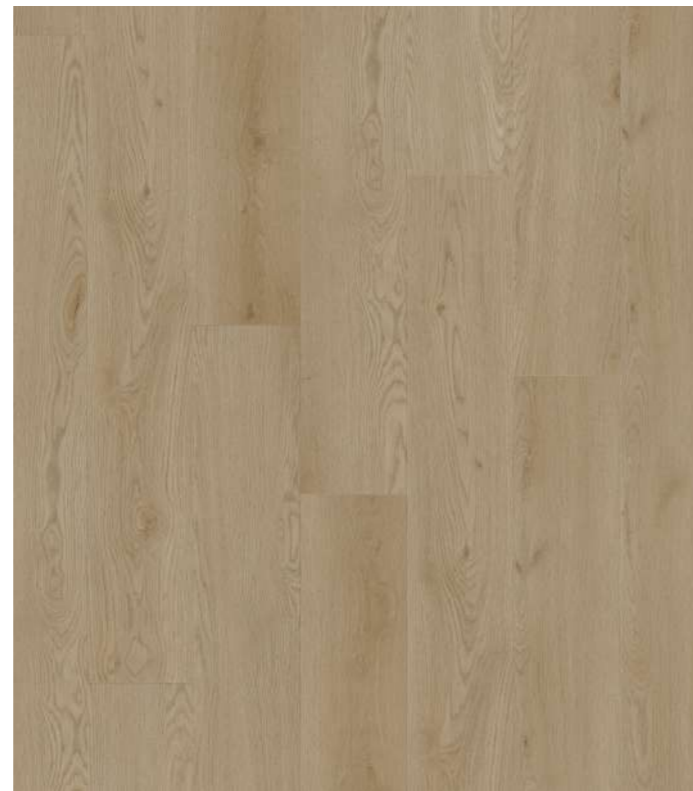
Booker Oak | 140