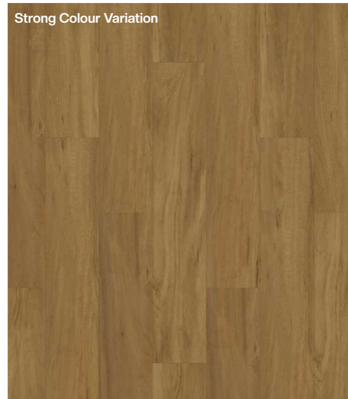
Tasmanian Hardwood Classic | 450