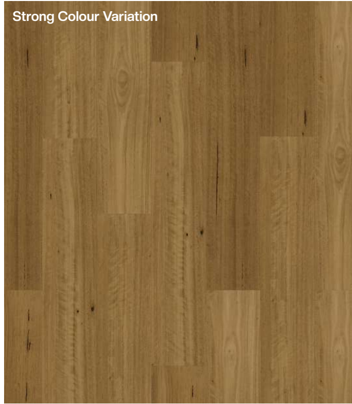
Blackbutt Traditional | 250