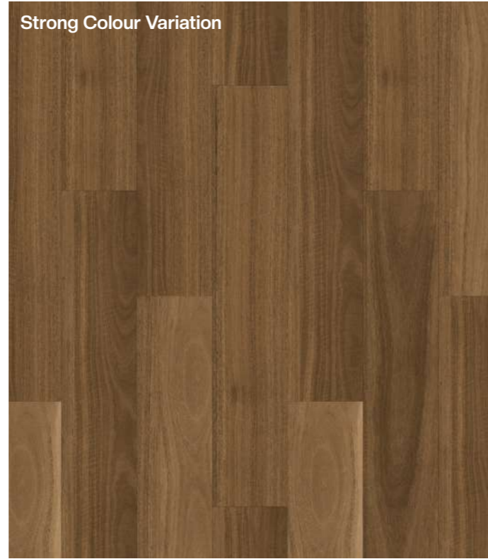
Spotted Gum Traditional | 360