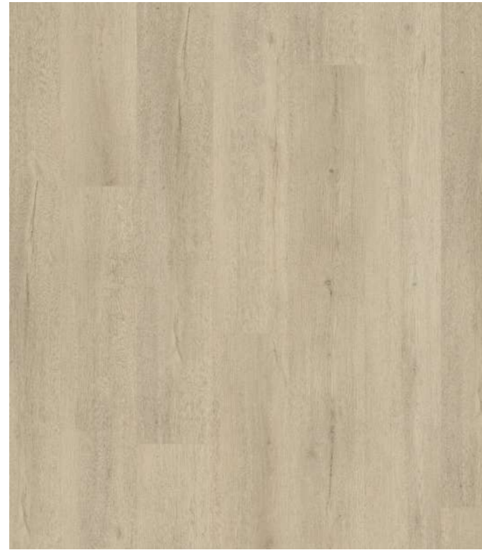
Silver Oak | 110