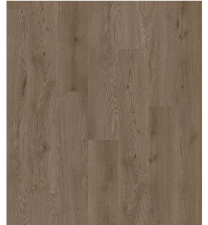
Malt Oak | 175