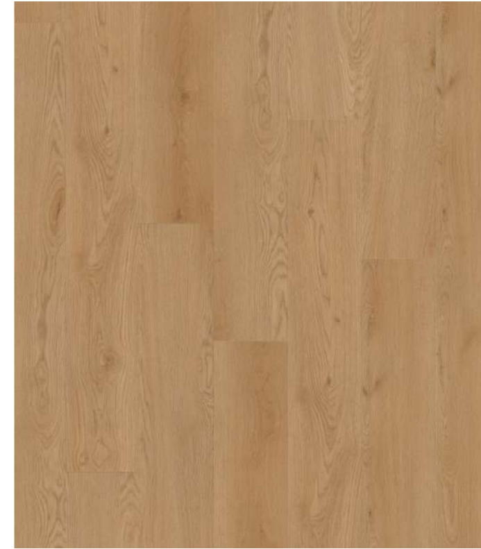
Euro Oak | 150