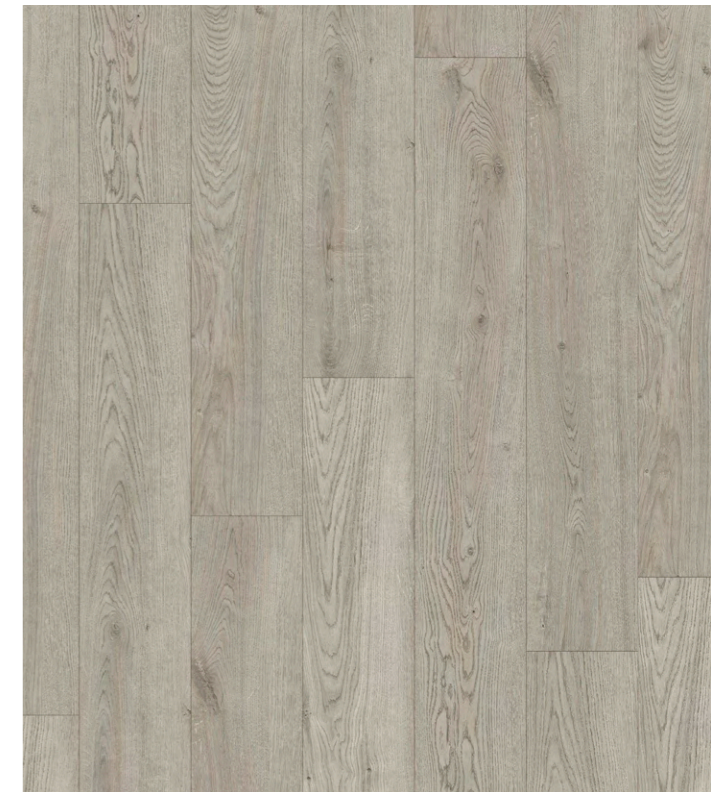
Drift Wood Oak | 120