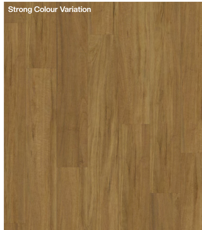
Tasmanian Hardwood Classic | 450