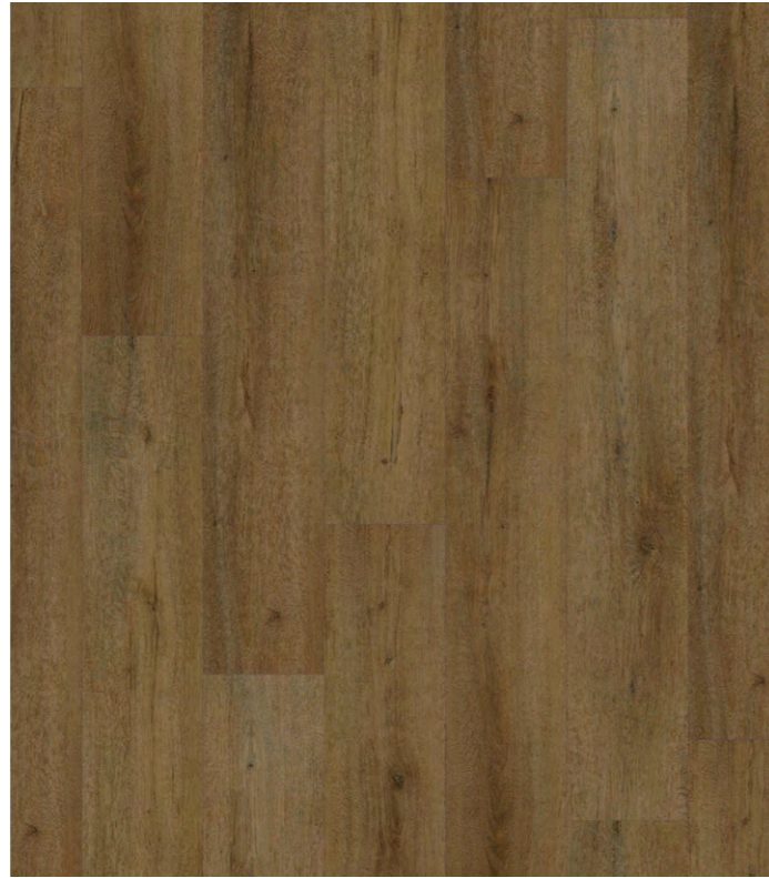
Coffee Oak | 175