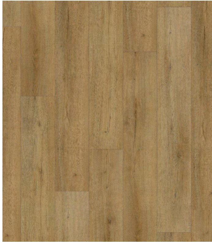
Warm Oak | 160