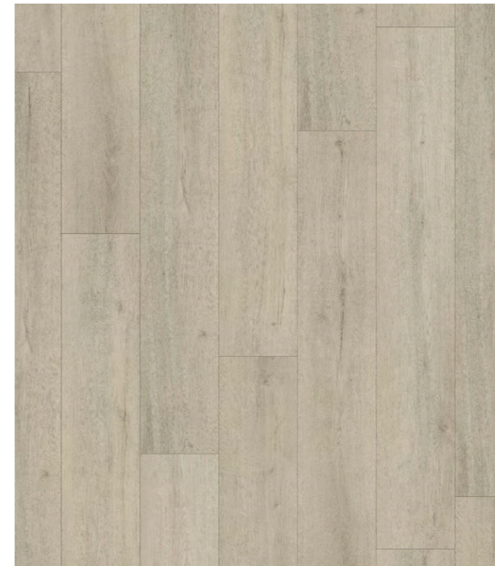
Silver Oak | 110