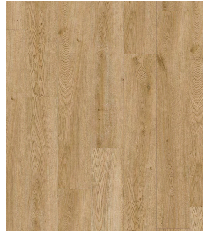
Latte Oak | 140