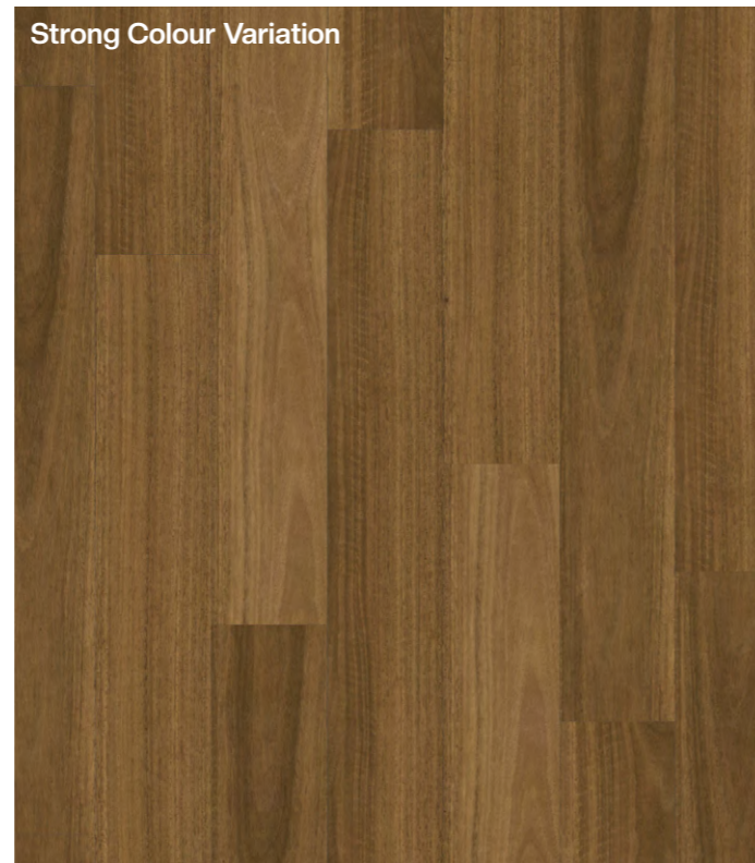
Spotted Gum Traditional | 360