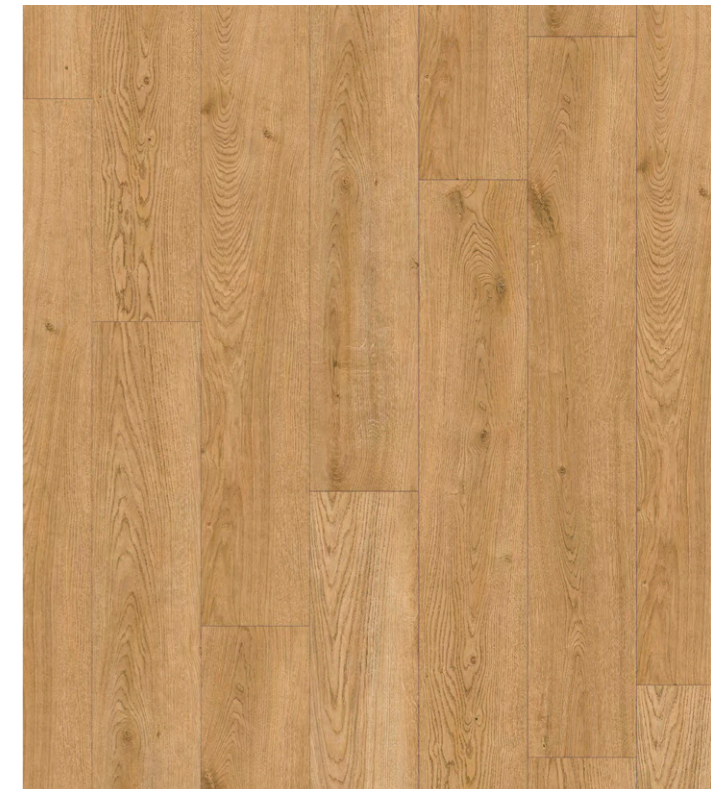
Classic Oak | 150