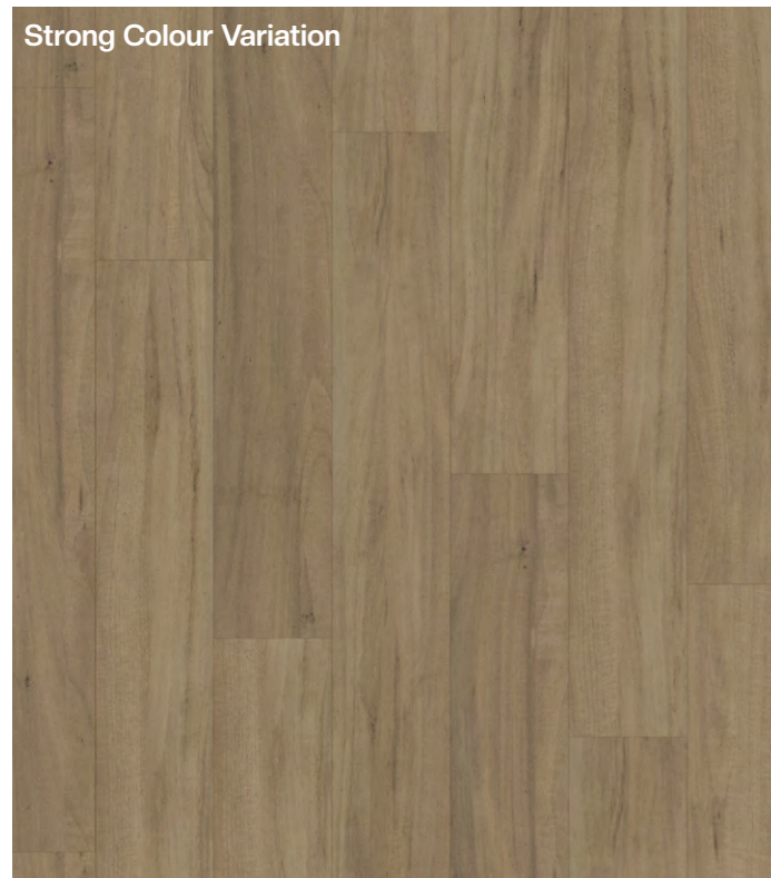
Weathered Tasmanian Oak | 430