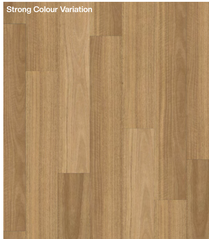
Salted Gum | 320