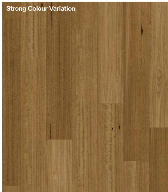
Blackbutt Traditional | 250